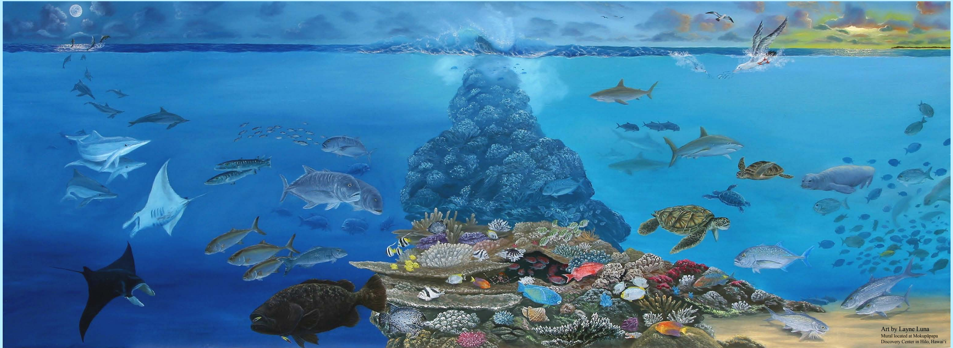
Art by Layne Luna Mural located at Mokupāpapa Discovery Center in Hilo, Hawai'i