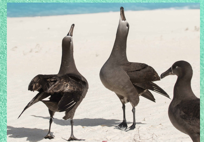
Black-footed albatross or ka‘upu ( Phoebastria nigripes ) practice their courting at Midway Atoll.