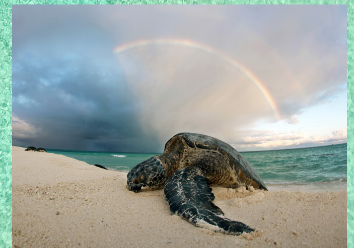
A Hawaiian green sea turtle or honu ( Chelonia mydas ) hauls out on a beach at French Frigate Shoals.

On the north end of Pearl and Hermes Atoll near the sand berm, divers check out the drop off from the reef, a hot spot where derelict fishing nets collect.