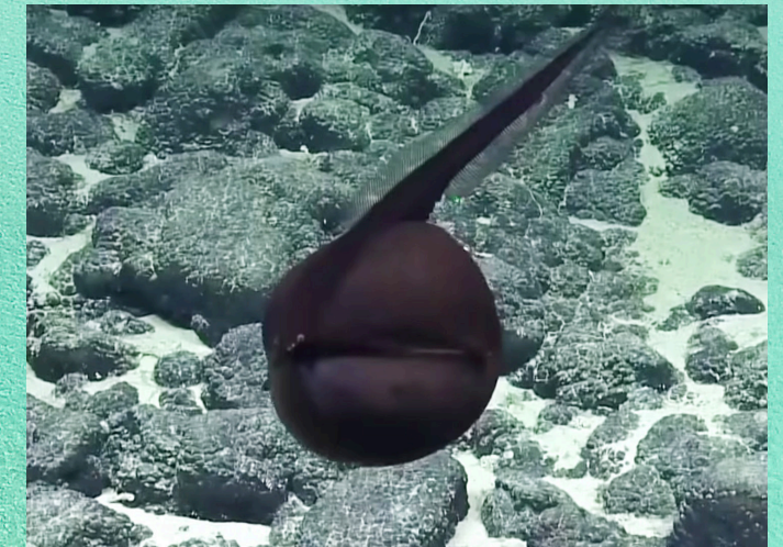
A gulper eel ( Eurypharynx pelecanooides ) inflates at an unnamed seamount in the Monument Expansion Area.

For more information on these stories visit www.papahanaumokuakea.gov