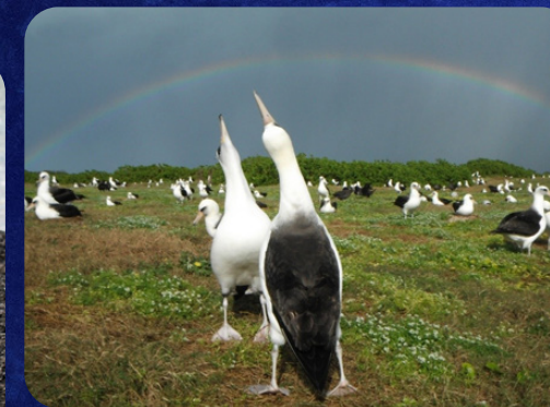
Background image: A bait ball of fish in Papahānaumokuākea Marine National Monument. Bait balls occur when fish swim in a very tightly packed formation often used by large schools of small fish to defend themselves against predators. Overlaid images from left to right: A Hawaiian monk seal or ‘ilioholoikauaua ( Monachus schauinslandi ) enjoys the freedom of strategic holes cut into the finger-like remnants of Tern Island’s rusting corrugated steel sea-wall. Hurricane Walaka exacerbated erosion of Tern Island’s shoreline areas, further exposing the sea-wall which had routinely trapped monk seals and sea turtles during tidal shifts. Mahie Wilhelm and Ka‘ehukai Goin lead the crew of the first major expedition in 2020 in oli (Hawaiian chant) just prior to departure. Bonin petrel or nunulu ( Pterodroma hypoleuca ). Hilina‘i, one of two malnourished Hawaiian monk seal pups at Pearl and Hermes in 2019, resting on a rocky ledge prior to her capture and rehabilitation. Laysan albatross or mōli ( Phoebastria immutabilis ) nesting at Kure Atoll post-eradication of Verbesina encelioides.