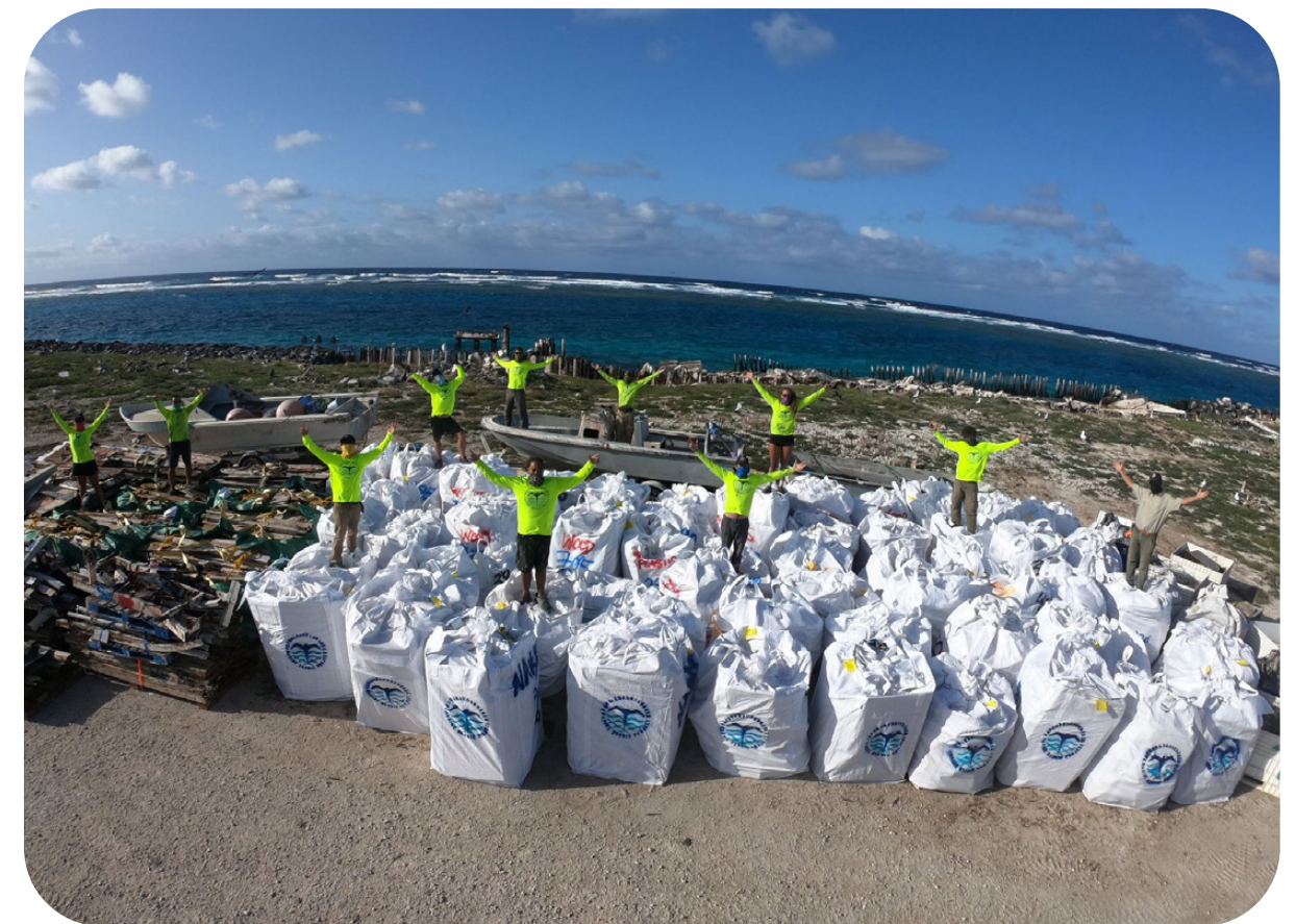
The 11 person crew poses with collected debris prior to being loaded onto the M/V Imua . Debris ranged from scrap wood, plastics, and fishing nets to metal, boat hulls, and roofing materials.

To support permitted activities, authorized individuals may either enter the monument on permitted vessels or aircraft to Midway Atoll. There were a total of 30 permitted flights to and from the monument, a 12% reduction from 2019. Permitted vessel entries and exits are defined as any instance in which a vessel is permitted to enter the monument to conduct authorized activities and subsequently exits the monument. For reporting purposes, any further authorized entry of the same vessel is counted as a second vessel entry. In 2020, there were eight permitted vessel entries into the monument done by seven permitted vessels.