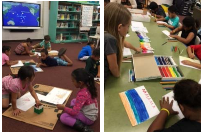
Left: Hau‘ula Elementary first graders color PMNM reef posters. Right: Hau‘ula Elementary fourth graders create posters about native species in PMNM.

On nine days between January 15 and February 11, PMNM staff visited Hau‘ula Elementary School to teach a series of lessons about PMNM as part of the Navigating Change Program. Kindergarteners, first and second graders were introduced to PMNM and then completed an art activity. Third graders learned about albatross and marine debris and, in a subsequent lesson, completed a bolus dissection and analysis. Fourth graders learned about the native plants and animals that call PMNM home and how they are affected by invasive species. Fifth and sixth graders, and Hawaiian Immersion students (K-6) learned about the cultural significance of PMNM to Native Hawaiians. Approximately 320 students and 20 adults participated in the lessons, which were coordinated and facilitated by PMNM Education Specialist Kainoa Kaulukukui-Narikawa. PMNM will be scheduling more Navigating Change lessons and field trip experiences with Hau‘ula Elementary School in the months to come. For more information, contact Kainoa.Kaulukukui@noaa.gov .