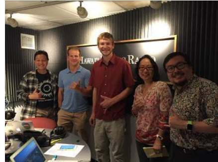
PMNM promotes Okeanos Explorer expedition via live tours, webinars and radio shows.