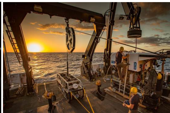
Left: A high-density community of deep-sea corals and sponges at a depth of 2,000 m surveyed during the expedition. Right: The NOAA Ship Okeanos Explorer ’s two-body ROV system after a successful dive inside PMNM.