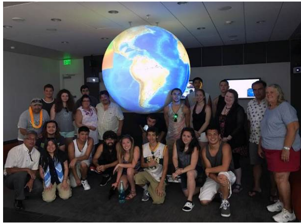
Olympic Coast Suquamish Tribe students visit NOAA's Inouye Regional Center.