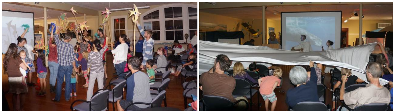
Audience members participate in “Dreaming Whales.”