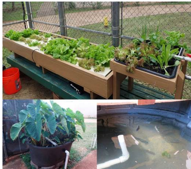
Fish, taro and veggies grown in a living lab setup at Kapa'a Middle School.

The systems are finally up and running and students are regularly testing water samples to track parameters such as nitrites, nitrates, dissolved oxygen, temperature and pH. The discussion in the classroom can then take many paths, among those being how similar processes in the ocean affect climate change as well as reef and watershed health. For more information, contact Yumi.Yasutake@noaa.gov .