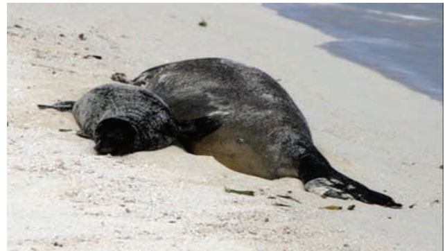
Nursing monk seal pup and mother

Strict water, power, fuel, and food conservation measures continued throughout the month of July at Tern. All freshwater is collected from rain, power is primarily solar-generated, and all fuel for back-up generators and boats, as well as all food, is supplied off-island. The summer population of 17 managers, scientists and volunteers welcomed the little bit of rain that added 1,700 gallons (8 days of use) to their water supply.