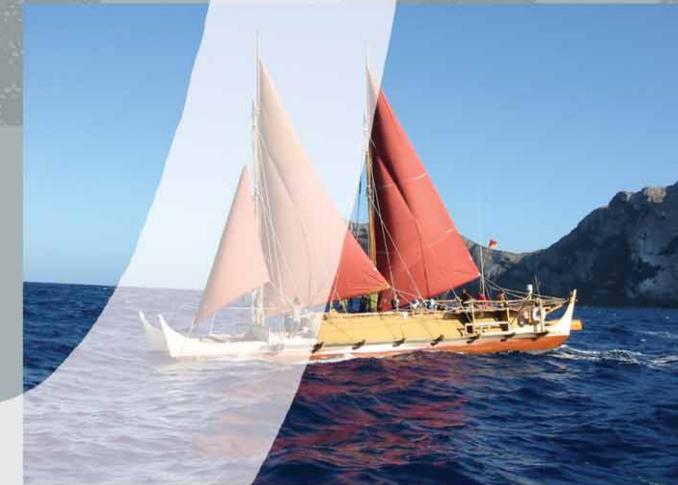
Double hulled sailing canoe, Hokulea, sailing in the Papahanaumokuakea Marine National Monument