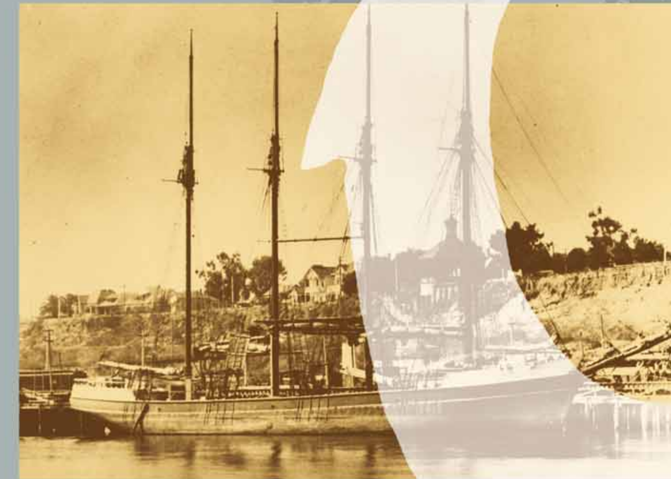
Schooner Churchill, lost at French Frigate Shoals 1917