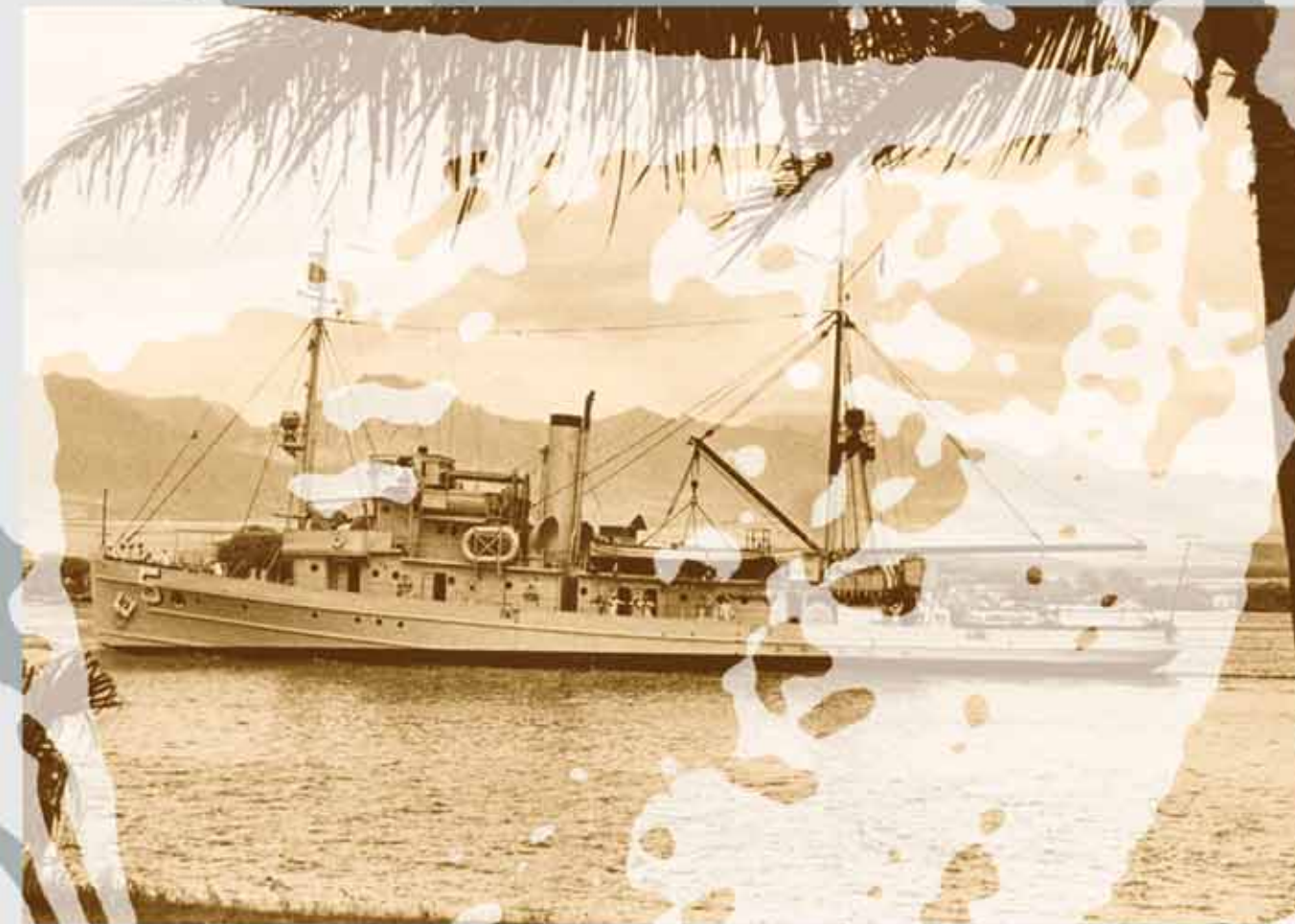
U.S.S. Tanager (AM-5) at Pearl Harbor before sailing to the Northwestern Hawaiian Islands, 1920s