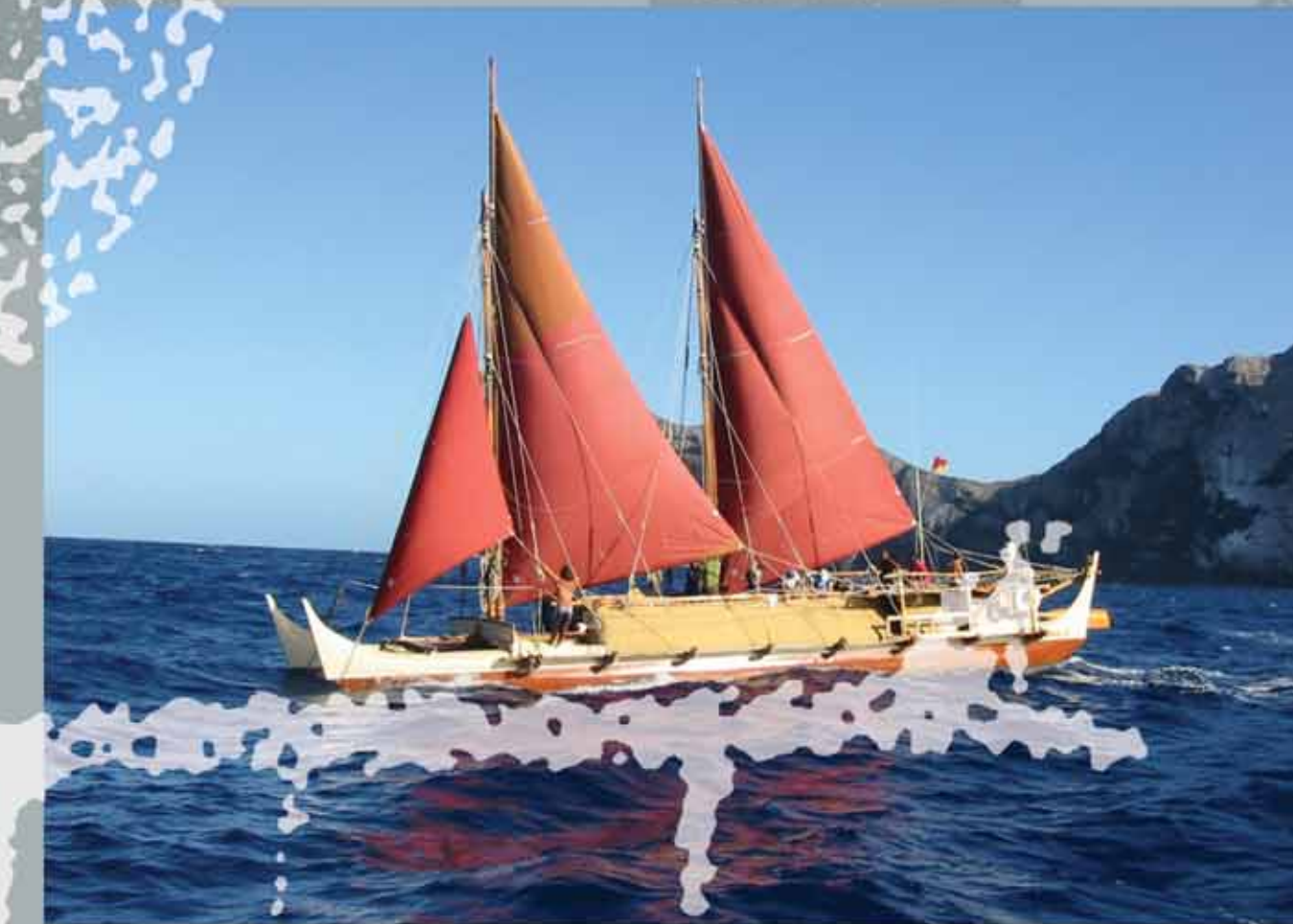
Double hulled sailing canoe, Hokulea, sailing in the Papahānaumokuākea Marine National Monument