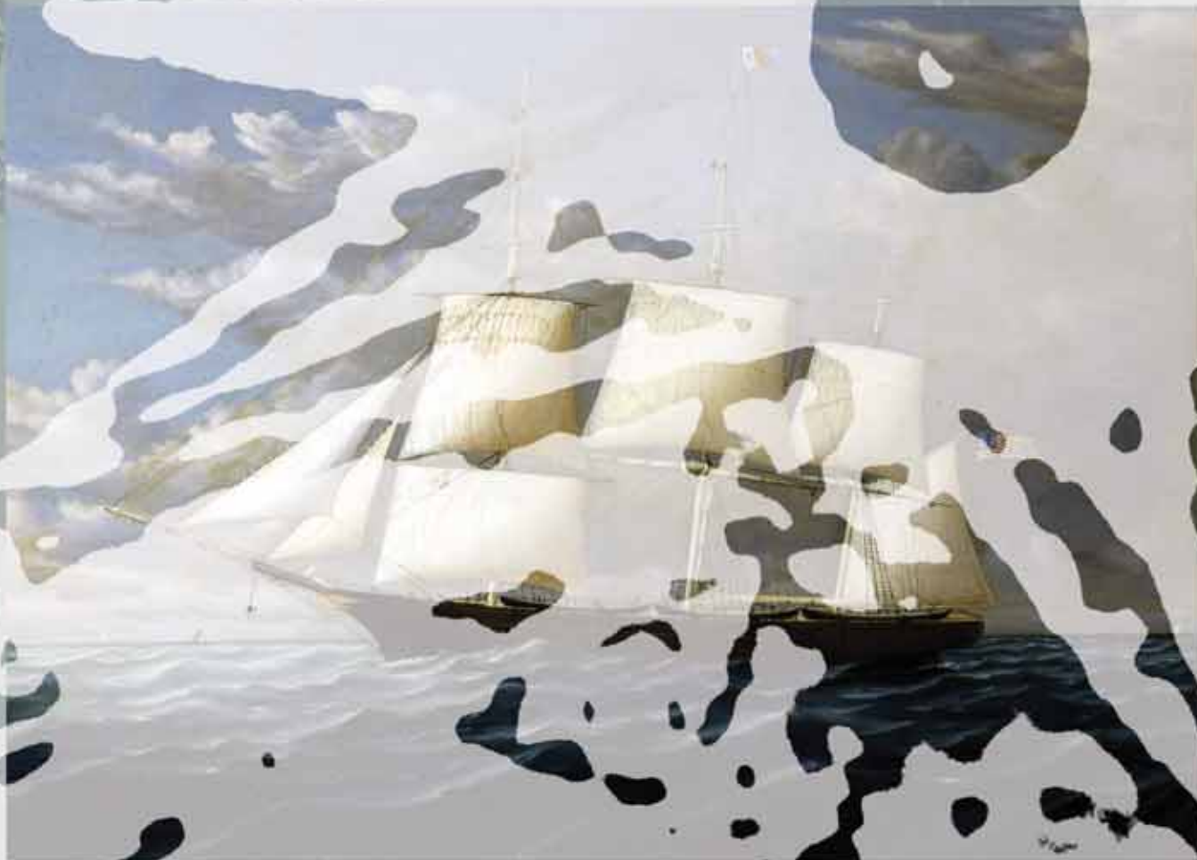
Whaling ship Daniel Wood, wrecked at French Frigate Shoals 1867