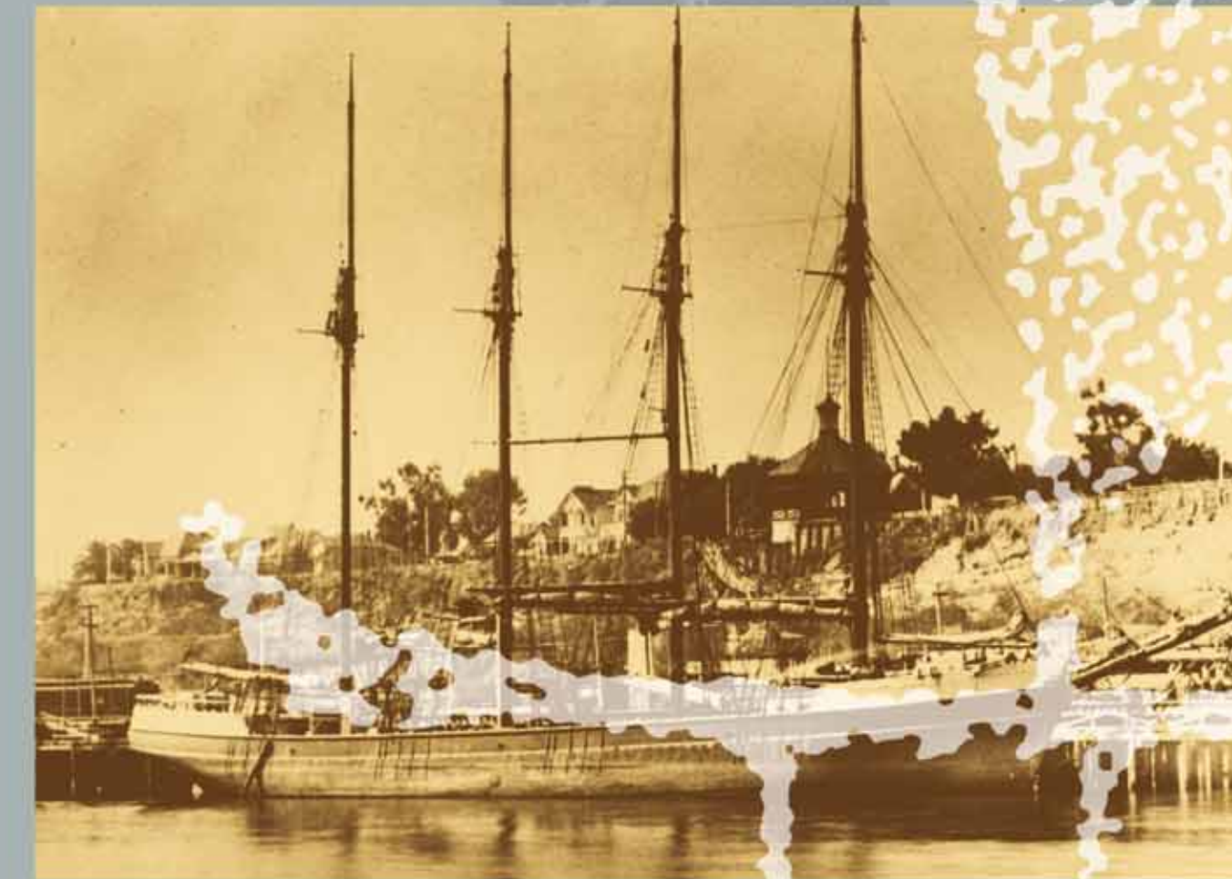
Schooner Churchill, lost at French Frigate Shoals 1917