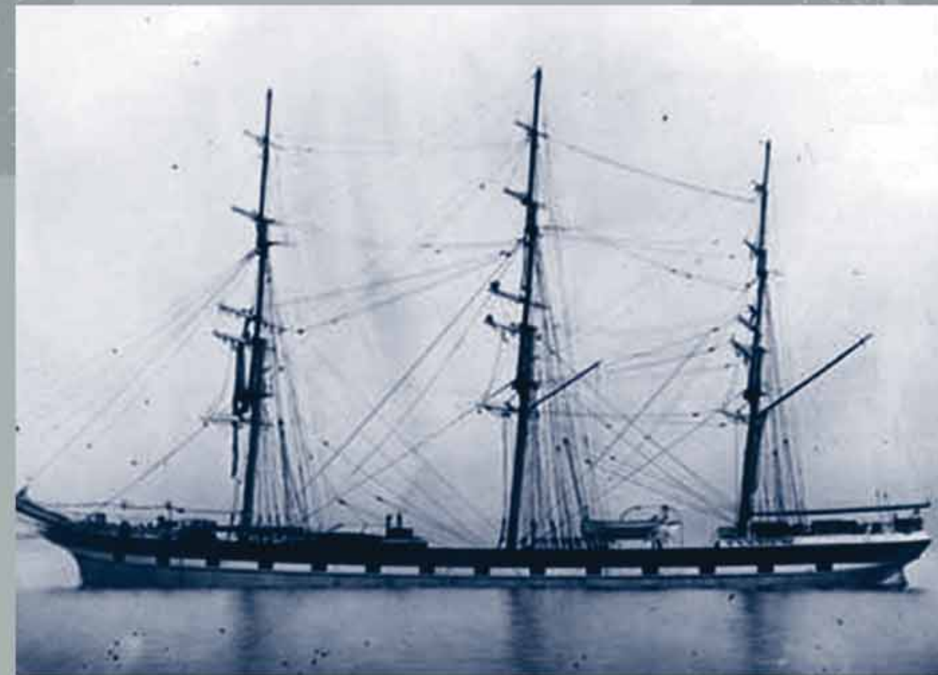
Sailing vessel, Dunnottar Castle, wrecked at Kure Atoll in 1872