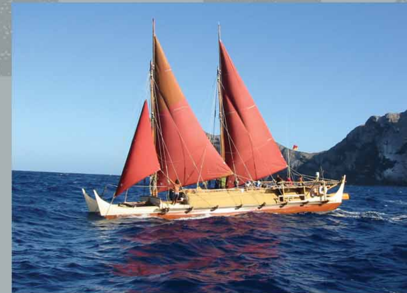
Double hulled sailing canoe, Hokulea, sailing in the Papahanaumokuakea Marine National Monument