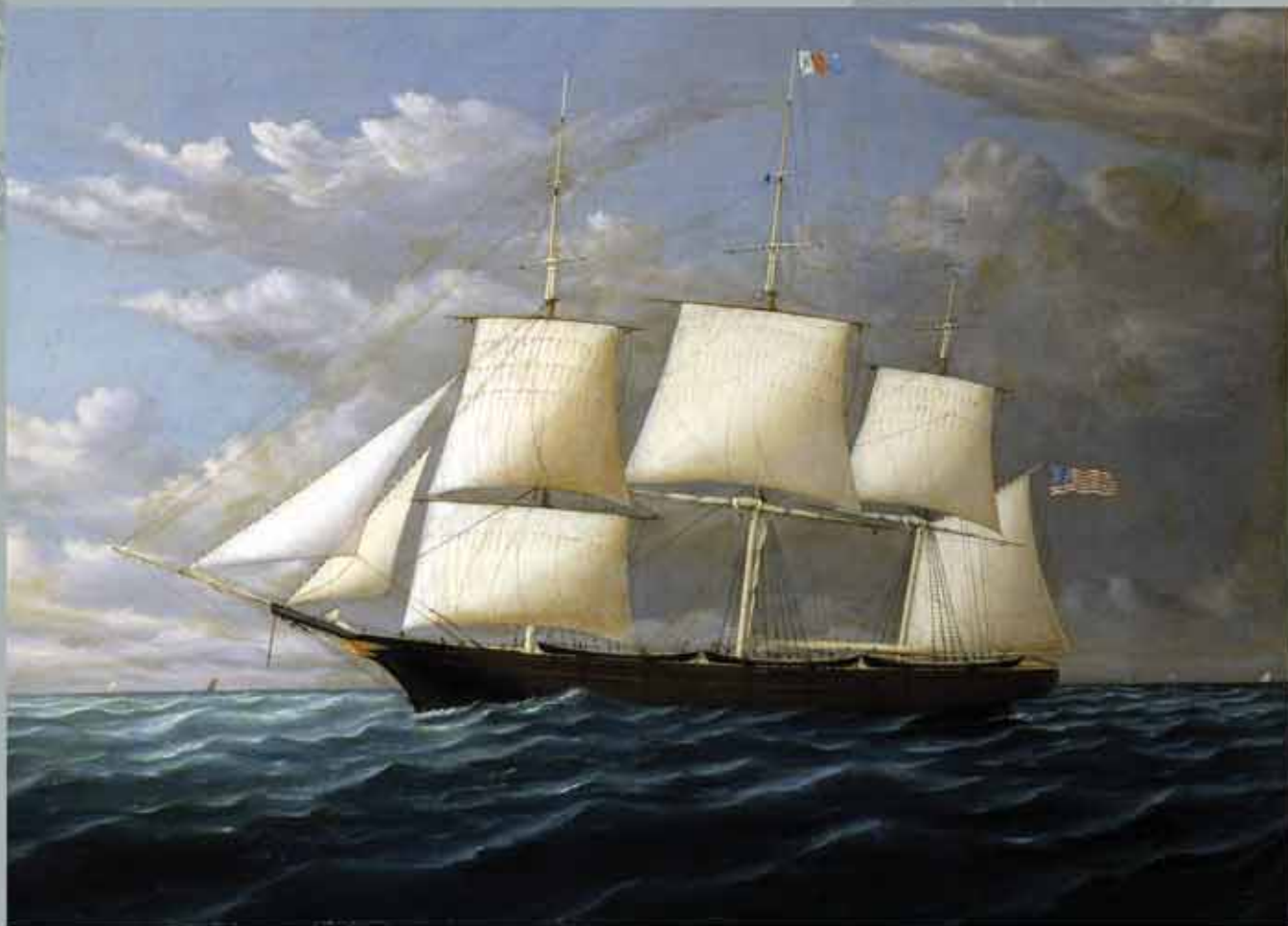
Whaling ship Daniel Wood, wrecked at French Frigate Shoals 1867