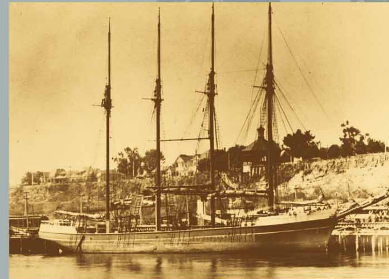
Schooner Churchill, lost at French Frigate Shoals 1917