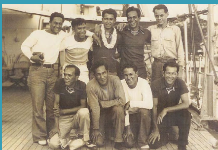
Hui Panalā'au members, 1936