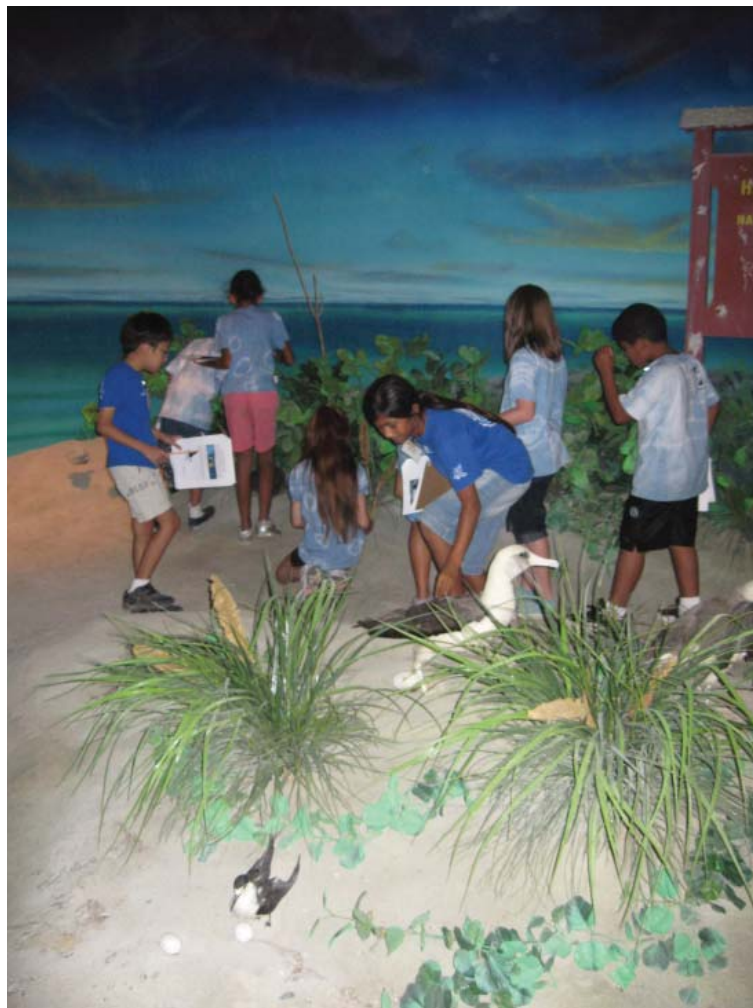
Students from Hahaione Elementary School in East Honolulu explore the Northwestern Hawaiian Islands through an exhibit at the Hawai‘i Maritime Center.