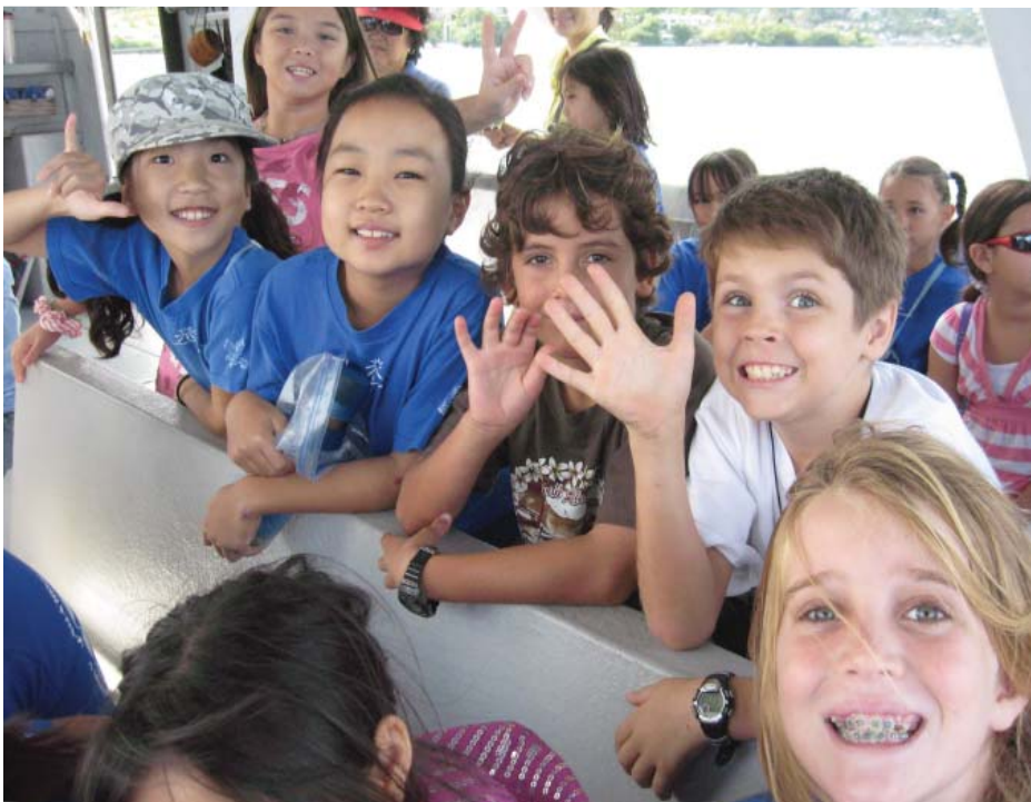
Navigating Change also brings students to Moku o Lo‘e at the Hawai‘i Institute of Marine Biology.

Maunalua Bay is only the first community to participate in Navigating Change. During the 2009-2010 school year, the program will focus its efforts in Hilo Bay on the Island of Hawai‘i. To learn more, visit the Navigating Change website at www.hawaiianatolls.org .