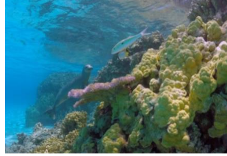
A juvenile Hawaiian monk seal ('īlioholoikauaua) swims near Trig Island, French Frigate Shoals.

The foundational framework of any sanctuary designation and future updates to the Monument Management Plan will be done in coordination to ensure consistency of protections.