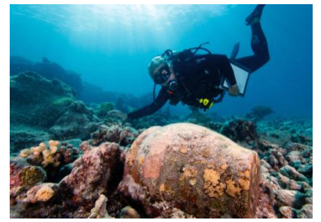
NOAA maritime archaeologists located the wreck of the Two Brothers , lost in 1823.

The establishment of a national marine sanctuary would ensure strong and lasting protection for the marine waters of the