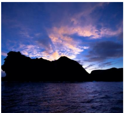
Mokumanamana (Necker Island) is known for its numerous religious sites and artifacts.