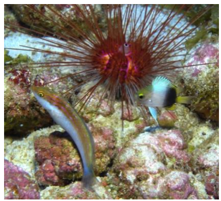
Rare species live at Kure Atoll.