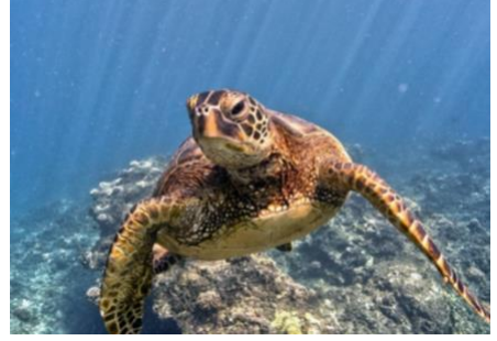
Papahānaumokuākea provides refuge for endangered species such as the Hawaiian green sea turtle (honu).

Native Hawaiian culture is a foundational element of the management of Papahānaumokuākea. We will continue to honor and perpetuate spiritual and cultural relationships with this special place.