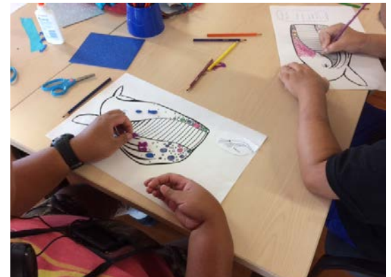
Arc of Hilo participants start on their humpback whale holiday art projects.