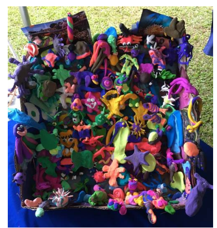
PMNM's Build a Coral Reef activity at the Hāna Limu Festival.