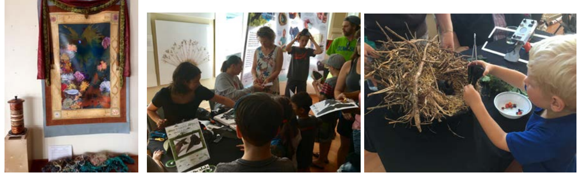
Left to right: One piece in the Rama Exhibition ; 'Alalā public celebration activities ; Young visitor learns how the Hawaiian crows are fed while in captivity