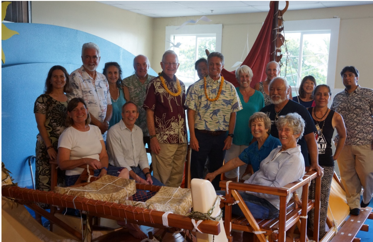
RAC members at Mokupāpapa Discovery Center Hilo, Hawai‘i in July 2017