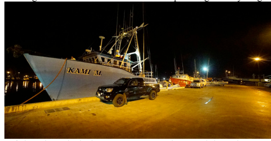
A fishing boat docked at Pier 38 next to the Honolulu Fish Auction this week.

Given the high demand for fresh ahi in Hawaii, there's a lot of money on the table. The price of tuna at the Honolulu Fish Auction on Wednesday ranged from $4.86 to $6.48 per pound. That's up from a week ago, when it was $2.65 to $3.64, but still below where it was in the weeks after the longliners hit their limit and had to stop fishing in early August.