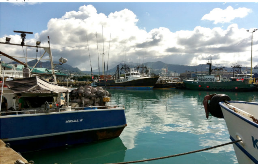
Researchers found that tuna fishers may not even be aware that some groups have learned how to avoid sharks more effectively.

The study found that "enhanced communication channels across segregated fisher groups could have prevented the incidental catch of over 46,000 sharks between 2008 and 2012 in a single commercial fishery."