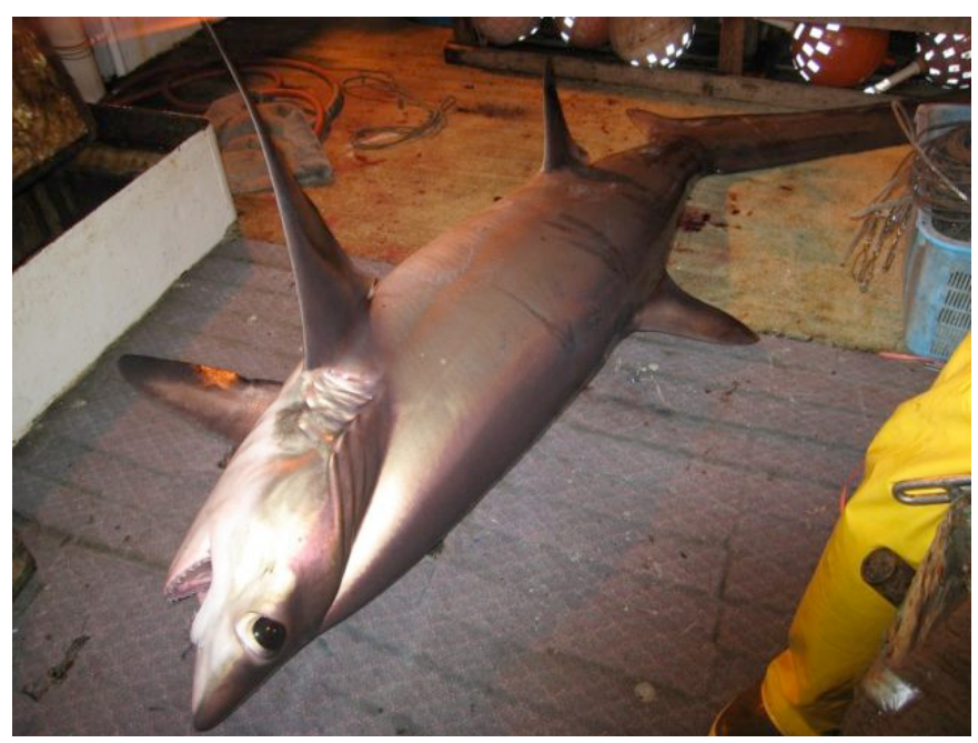
University researchers say tuna fishers could save more sharks, such as this dead bigeye thresher shark, by sharing information with each other.

"To use the phrase, 'birds of a feather flock together,' we definitely found that to be the case here — fishers primarily shared information with those most similar to themselves," she said in the release.