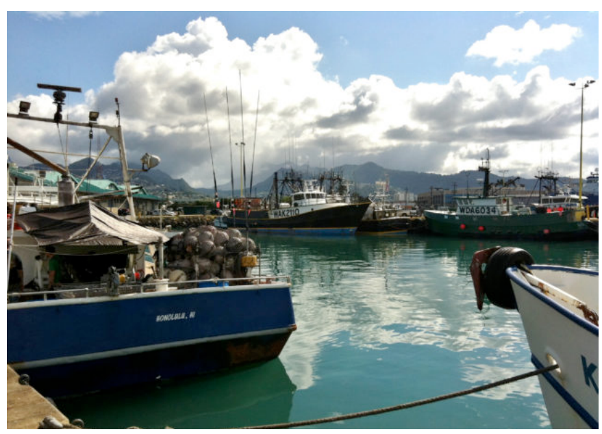
Longline fishers drop miles of line off their boats with thousands of hooks, primarily targeting ahi for sashimi markets.

Conservationists argue that if the monument is expanded as proposed and the longliners theoretically lose access to 8 percent of the fish they catch, they'd have four or five months to catch that ahi elsewhere since they are hitting the quota by July or August.