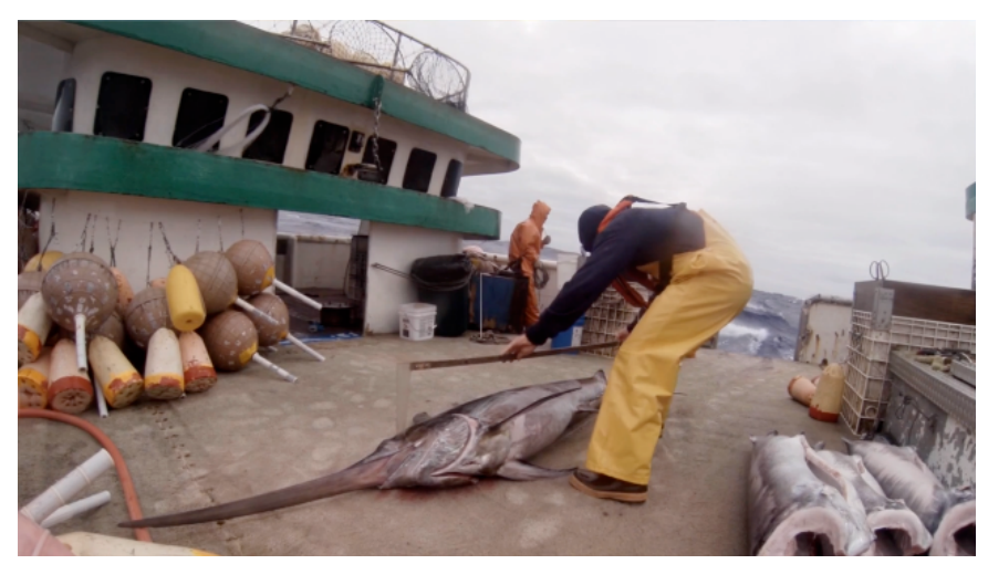
A fisheries observer measures a swordfish caught on a longline vessel working out of Hawaii.

In 2015, NOAA data showed that no enforcement action was taken despite a record number of assaults, and that more than half the cases remained open even though many months had passed since the incidents had been reported.