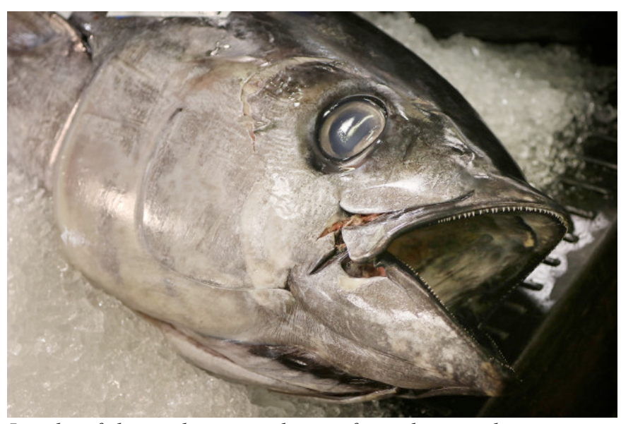
Longline fishers, who target ahi tuna for sashimi markets, oppose expanding Papahanaumokuakea Marine National Monument.

The monument, officially designated by President Bush in 2007 as Papahanaumokuakea, protects the habitat of more than 7,000 marine species, a quarter of which are believed to be found nowhere else. It's also home to 14 million seabirds that nest there.