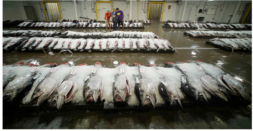
Tuna are packed on ice at the Honolulu Fish Auction on Monday.

QMI can assign its rights and obligations to the Hawaii Longline Association, a wholly owned subsidiary of QMI. HLA is a nonprofit trade association formed to advance and benefit the Hawaii-based commercial longline fisheries industry.