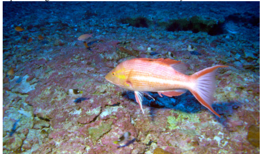
A male Hawaiian Pigfish is seen at 320 feet at Kure Atoll, which is 1,300 miles northwest of Honolulu inside the boundaries of Papahanaumokuakea Marine National Monument.

representing a $6.83 million loss to the industry.