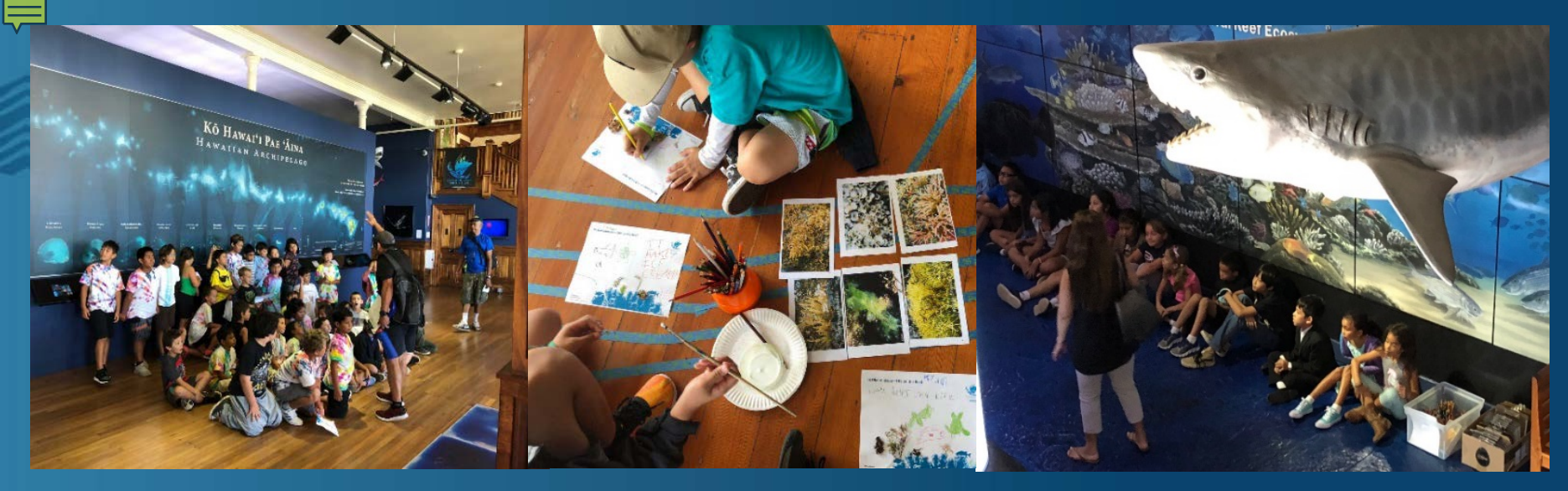
Summer camp groups learn about PMNM, study Hawai'i limu (marine algae) and participate in a reef fish observation activity.