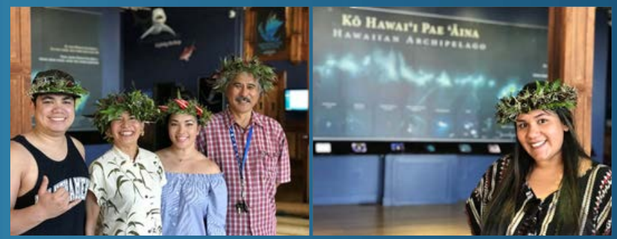
OHA Haku Lei workshop participants show off their creations.