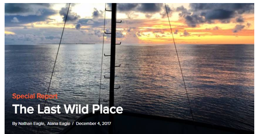
PMNM is featured in an interactive special report "The Last Wild Place" in Honolulu Civil Beat.

PMNM Launches "Can You Say It" Annual Awareness Campaign (CBO 3.3) On December 5, PMNM's annual awareness campaign, "Can You Say It?" went live at Ala Moana Center, one of the largest malls in the country. The ad was created in response to the Monument's expansion last year and the desire of folks to learn how to pronounce the name Papahānaumokuākea. The poster provided a phonetic version of the name as well as a link to the PMNM website audio files to help people learn not only how to say the name but what it means, and encourages visitors to videotape and share themselves saying the name on social media with hashtag #canyousayit. The poster was up for the month of December, with traffic of more than 20,000 visitors a day at that location. For more information, contact Toni.Parras@noaa.gov.