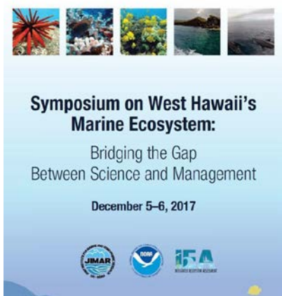
Flyer for the Symposium on West Hawaii's Marine Ecosystem held in Kailua-Kona, Hawai'i.

On December 5 and 6, PMNM staff participated in the Symposium on West Hawaii's Marine Ecosystem organized by NOAA's PIFSC. PMNM's Keo Lopes presented work investigating the effects of SCUBA exhaust on fish surveys, offering insight on the differences between surveys conducted with conventional SCUBA and those done with exhaust-free Closed-Circuit Rebreathers. Preliminary results from data collected within PMNM show significant differences in the number of jacks observed (more on conventional SCUBA), possibly indicating an attraction to divers' bubbles, thus increasing the number of observations. Staff from State DAR, PIFSC, The Nature Conservancy, and PMNM presented at this symposium. For more information, contact Keolohilani.Lopes@noaa.gov.