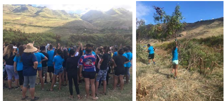
Waianae Intermediate students remove invasive species as part of the Keawa 'ula Beach restoration project.