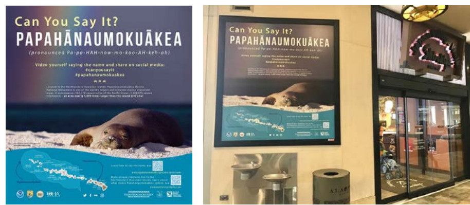
Papahānaumokuākea's "Can You Say It" Awareness Poster at Ala Moana mall.