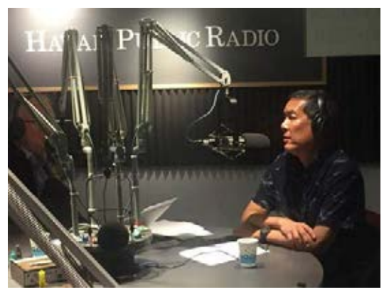
NOAA Deputy Superintendent for PMNM talks about the Monument on Hawai'i Public Radio's morning show "The Conversation."