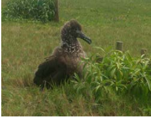
Left: PMNM staff from ONMS, Office of Hawaiian Affairs, and U.S. Fish and Wildlife Service pose with marine debris they collected. Right: a protected black-footed albatross chick translocated from PMNM to Oʻahu.