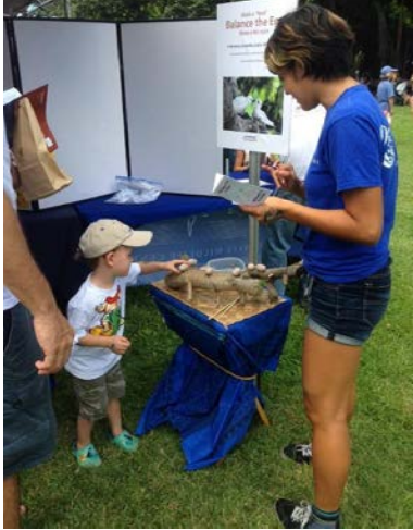
Visitors to PMNM's booth learn about the manu o Kū (left) and play a "balance the manu o Kū egg on the branch" game (right).