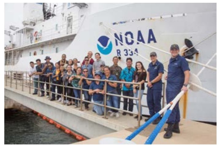
Kānehūnāmoku Voyaging Academy students tour NOAA Ship Hi'ialakai.