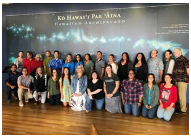
Papahānaumokuākea Native Hawaiian Cultural Working Group and PMNM Co-managers at the Mokupāpapa Discovery Center.