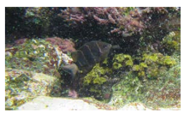
The first Phoenix Islands damselfish (Plectroglyphidodon phoenixensis) ever recorded from PMNM. 1 m depth, French Frigate Shoals.

Plectroglyphidodon phoenixensis (Schultz, 1943) from the Northwestern Hawaiian Islands," is available at <a href="https://doi.org/10.1186/s41200-018-0142-5">https://doi.org/10.1186/s41200-018-0142-5</a>. For more information, contact <a href="mailto:Randall.Kosaki@noaa.gov">Randall.Kosaki@noaa.gov</a>.