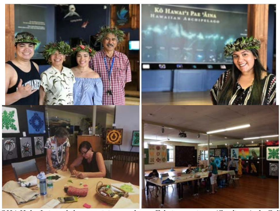
Top Row: OHA Haku Lei workshop participants show off their creations. Bottom Row: The Contemporary Hawaiian Quilt Show brought in hundreds of visitors, many new to MDC.