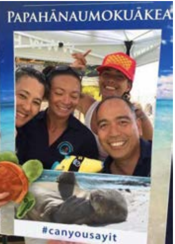
Visitors to Outrigger's OZONE Day at the Waikīkī Aquarium participate in PMNM's "Can You Say It" campaign, hidden picture coloring, and coral game.