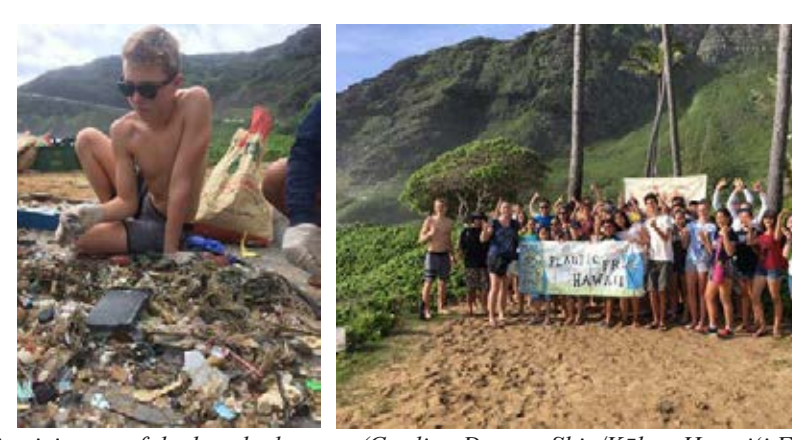
Participants of the beach cleanup.

On February 24, ONMS PMNM and HIHWNMS collaborated with Kōkua Hawai'i Foundation to provide an opportunity for people to participate in a beach cleanup and spot whales at Makapu'u Beach on O'ahu. ONMS staff organized a special shore-based whale watch during the Sanctuary Ocean Count at the beach cleanup site. Both organizations (ONMS and Kokua Hawai'i) also worked with Make Yourself Foundation and Incubus to provide a meet and greet with the rock band which is touring and performing in Hawai'i on March 13 and 14. Over 100 people participated, including students with Punahou School's JROTC, National Honors Society Sustainable Living Club. For more information. contact Naomi.McIntosh@noaa.gov.