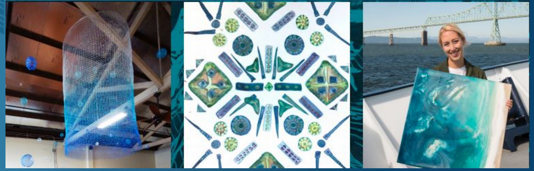
Highlights from the exhibit at Mokupāpapa Discovery Center