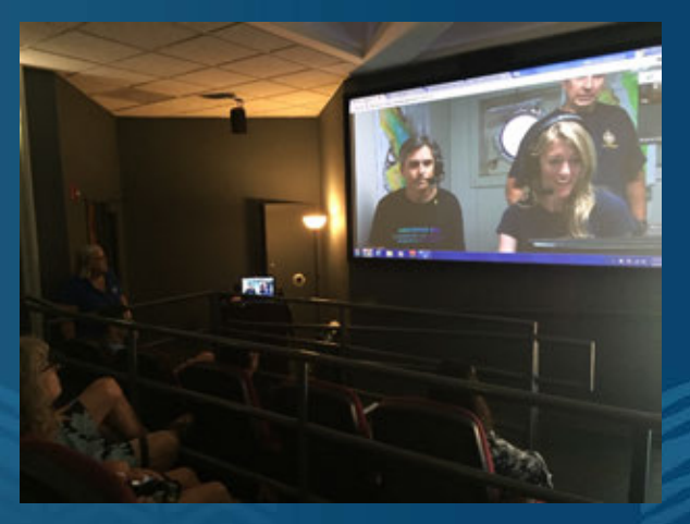
ONMS/PMNM supported live ship-to-shore interactions with the E/V Nautilus at Maui Ocean Center (left) and NOAA's IRC (right).