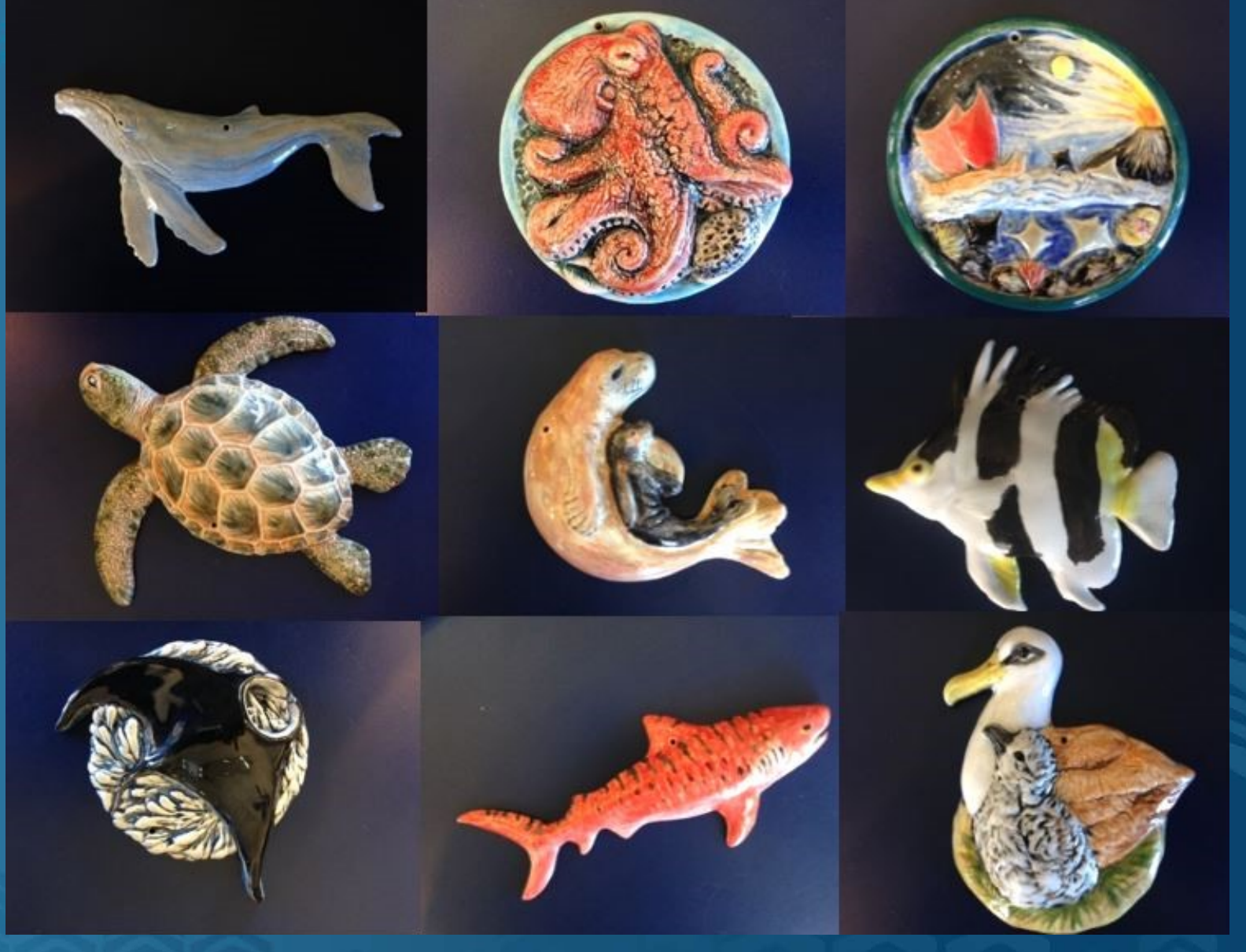
Families love painting/glazing their own PMNM-themed ornaments, custom crafted by Kīlauea Pottery.