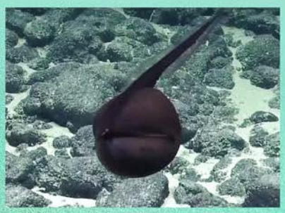
A gulper cel (Eurypharyex peleconoides) inflates at an unnamed seamount in the Monument Expansion Area: Photo by Ocean Exploration Trust

NOAA National Marine Fisheries Service Marine Turtle Biology and Assessment Program's Northwestern Hawaiian Islands green sea turtle nesting project monitors populations of turtles that migrate to the Northwestern Hawaiian Islands to breed and lay eggs. The majority of this research occurs at French Frigate Shoals, where an estimated 96 percent of all Hawaiian green sea turtle or honu (Chelonia mydus) migrate to reproduce. Biologists monitored impacts to the sea turtle population from hurricane Walaka which hit French Frigate Shoals in October 2018 with category 5 winds and decimated approximately 20 percent of the turtle nests still incubating on two islets (East and Tern). Researchers remain hopeful that green sea turtle populations will continue to thrive at French Frigate Shoals despite the impacts of Walaka.