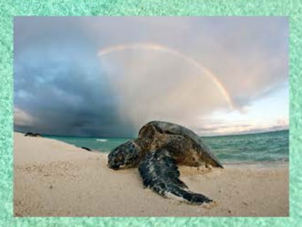
A Hawman given sea (in the or home (Chaloma drydio) hauls out on a beach at French Erigan Shoak

On the morth and of Pearl and Fleemes Atoll near the sand heror, divers check out the drop of from the rech a hot spot where derelict fishing nets collect.