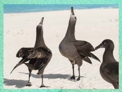
Plack-footed abatross or knups (Phychastria agripes) practice their courting at Midway Atoll