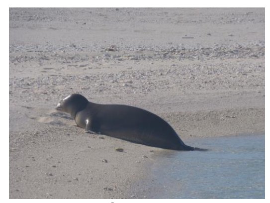
Pup 14 post-release