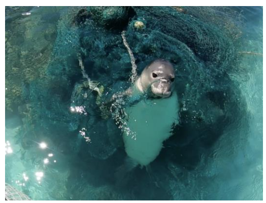
Pup 14 W/F entangled on patch reef

• 2020 Hawaiian monk seal (HMS) reproductive results: 15 pups born - 14 weaned, 1 died/disappeared. NMFS field camps cancelled for 2020. HMS surveys were conducted by DLNR personnel at least twice a month. DLNR disentangled Pup 14 W/F from marine debris conglomerate attached to nearshore patch reef on 18 September. Pup 14 had green netting tightly wrapped around her muzzle and neck. It is unknown how long she had been entangled prior to discovery.