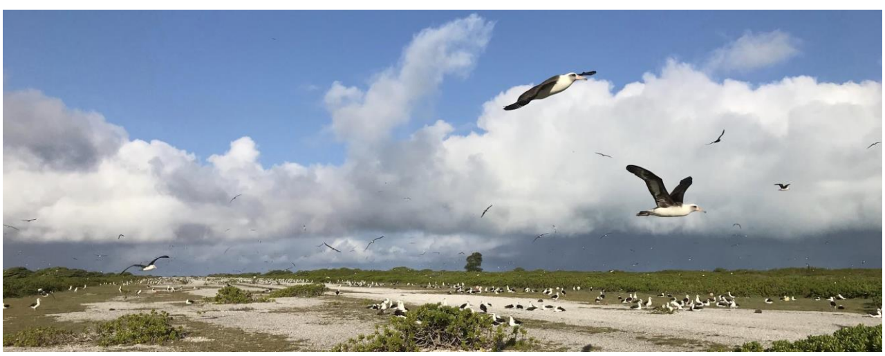
DLNR/DOFAW Kure Atoll Wildlife Sanctuary Papahānaumokuākea Marine National Monument