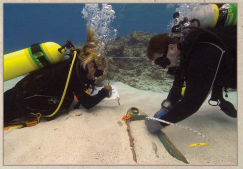
Underwater archaeologists map a 19th century whaling shipwreck site

The Pacific Islands include the most geographically isolated locations in the world. Nonetheless, these islands host a diverse marine environment. These aquatic settings range from rich coastal ecosystems of wetlands, shorelines and coral reefs, to the unexplored depths of the deep ocean trenches. As rich as the marine environment is in animal and plant species, the Pacific Islands retain a culture