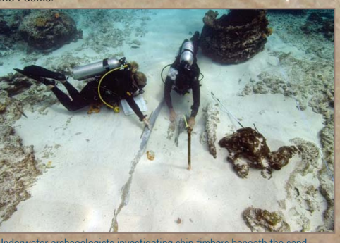
Underwater archaeologists investigating ship timbers beneath the sand

In the first half of the 19th century, whaling operations spread north into the Pacific basin in search of lucrative whaling grounds off South America, Australia, Japan and, finally, the Gulf of Alaska and the Bering Sea. Soon after the Balaena and the Equator harpooned the first whale off the coast of Maui in 1819, Hawai'i won its place on whalers' charts. Several whaling shipwrecks have recently been discovered in the Northwestern Hawaiian Islands and are currently being documented. Whaling wreck sites at Kure and Pearl and Hermes Atoll add to our understanding of 19th century voyaging in the Pacific.