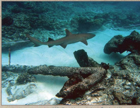
Whaling shipwreck site at Pearl and Hermes Ato

unique to themselves. Our island world revolves around the ocean—for pleasure, transportation and physical and spiritual sustenance, the ocean has shaped the way Pacific societies have evolved.