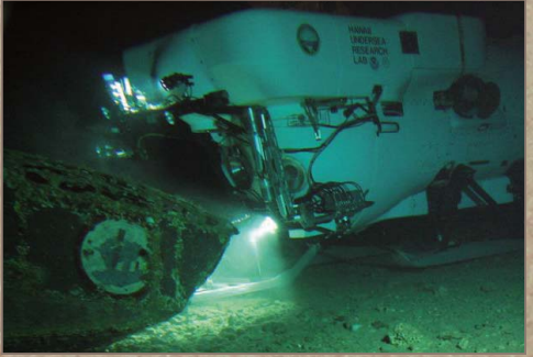
HURL submersible at the bow of a 1930's PK-1 flying boat