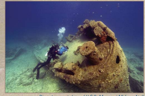
Diver documents bow of U.S.S. Macaw at Midway Atoll

role in Hawai'i and the Pacific. From within HURL's Pisces IV and V , research submersibles at a depth of about 1,400 feet, researchers recorded images of the crash sites, using digital video and still cameras. Preservation legislation supports the survey and inventory of these types of sites, and Navy ships and aircraft are specifically protected as military vessels.