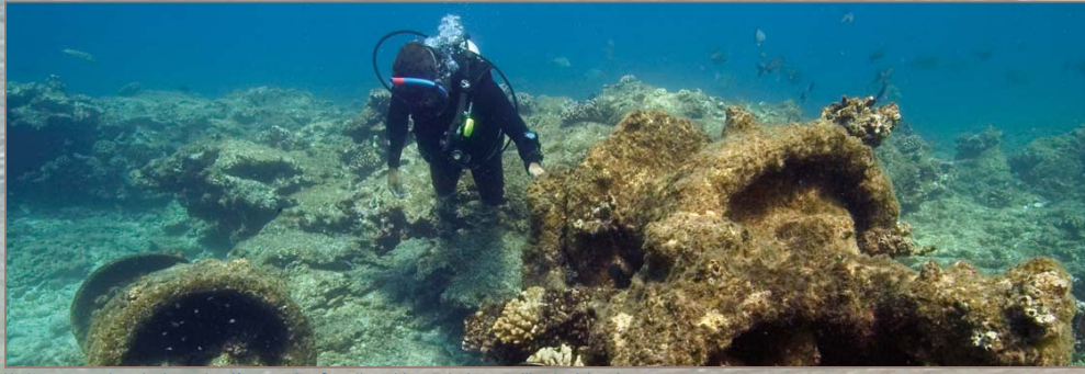
Underwater archaeologist and artifacts at the Carrollton shipwreck site, a sailing bark lost in 1906

With a history of approximately 1,500 years of continuous and intensive maritime activity, the Hawaiian Archipelago contains many historic shipwrecks and other types of submerged archaeological sites. The locations in this region witnessed a variety of Hawaiian and Pacific vessels and activities. These include traditional voyaging and fishing, aquaculture, copra traders, Japanese sampans, transpacific colliers, and the local wreckers or salvage companies from the main Hawaiian Islands, in addition to the naval activity that is a large part of Pacific Islands history. Documents indicate that there are over 80 U.S. Navy ships and submarines, hundreds of commercial sailing and steam vessels, and over 1,500 navy aircraft lost in these waters. Many of these vessel and aircraft losses are U.S. naval property and war graves associated with major historic events, or are sites older than 100 years and of potentially historic and archaeological interest.