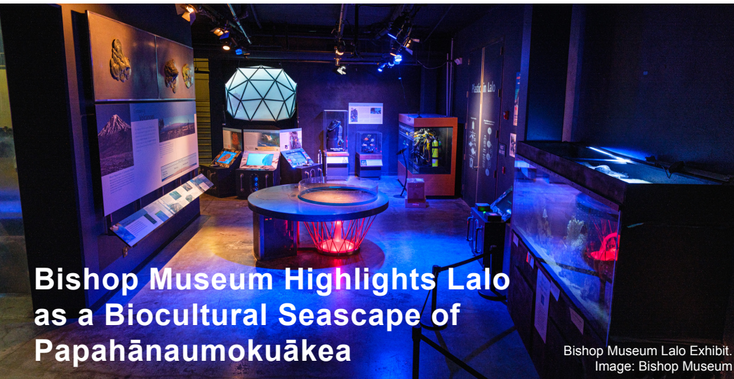
Bishop Museum Lalo Exhibit.